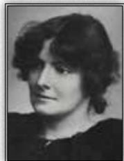
Memorial Guest of Honor E. Nesbit